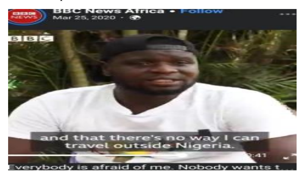
Figure 2: Social media fake news about a Nigerian, regarding Covid-19

On 21 December 2021, Reason Magazine reported the death of an Iraqi mother, whose "death" was caused by Trump's propaganda. The news bar of figure 1 (of the death of an Iraqi mother) proves the extent to which fake news can cause harm to an individual. This is one of many misrepresentations of political themes and intentions. According to Halliday (1985), the choice of lexical items in a proposition depends on an individual. The linguistic choices of the author of figure 1, could have also been deployed in a positive way to make his/her report, but the author chose to make the report the way it is. Language choices can make or mar a situation. Consider another example below: