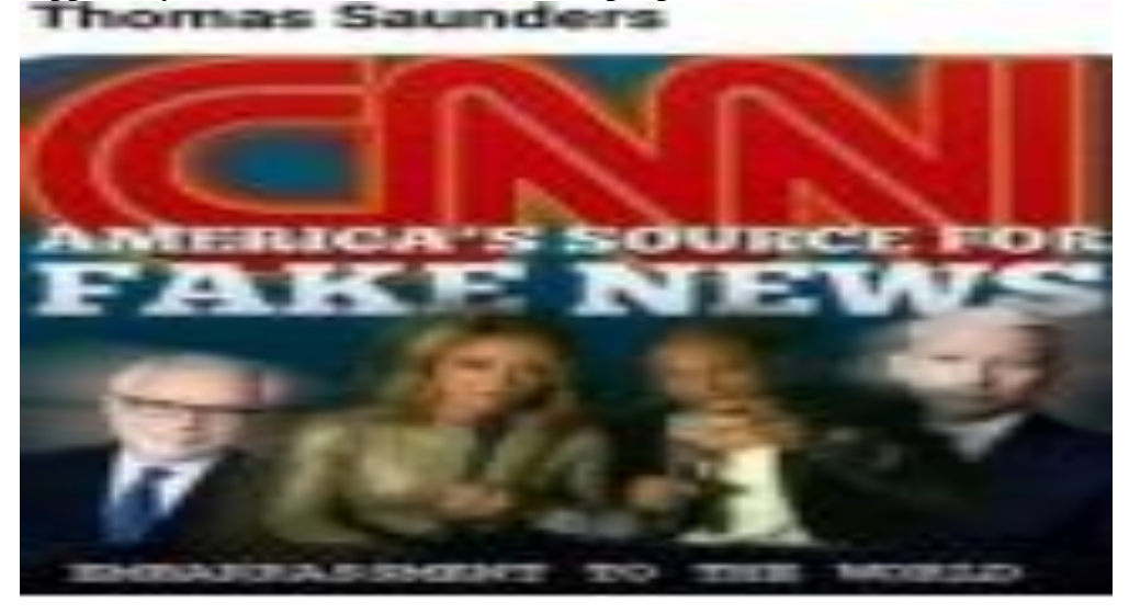
Figure 6: CNN accused of fake news