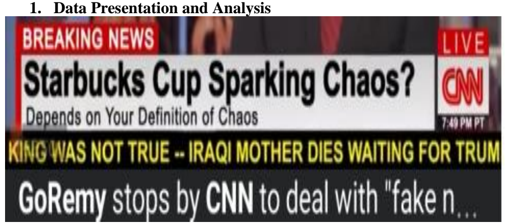
Figure 1: Fake news caused an audience's death in Iraq

The data for the study were sourced randomly form the internet. One of the criteria for the selection is the appearance of the data under the search tool "fake news". In other words, the data must appear under fake news for it to be selected. Seven items were selected for the study because of the page limit. The theoretical concept of Systemic Functional Linguistics by Halliday (1985, 1994) was applied to the data in the analysis to reveal that internet users' choices have a great role to play in the production of true or misleading information on social media.